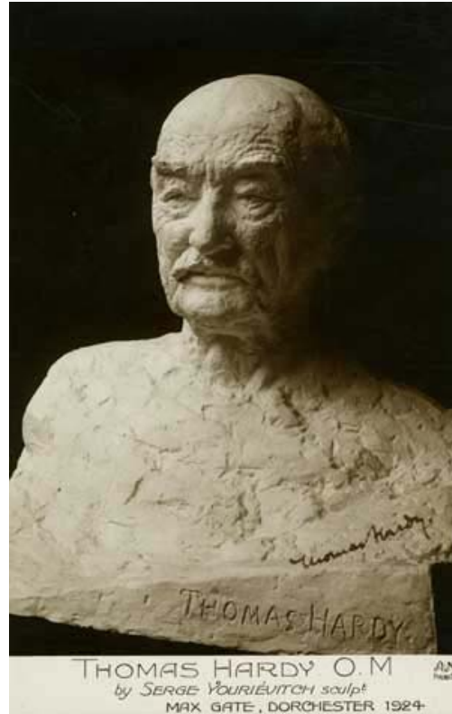
HARDY, THOMAS 71739 £1,250

Hand written letter by Thackeray (1811-1863). English novelist who wrote the 19th Century masterpieces including 'Vanity Fair' and 'Barry Lyndon'. Two faint paperclip marks appear at the top of the page otherwise in very fine condition.